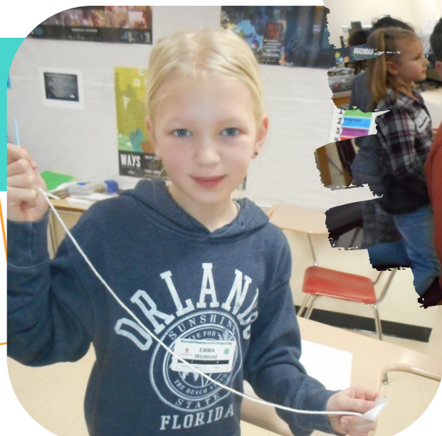
LEGO Bridge Challenge