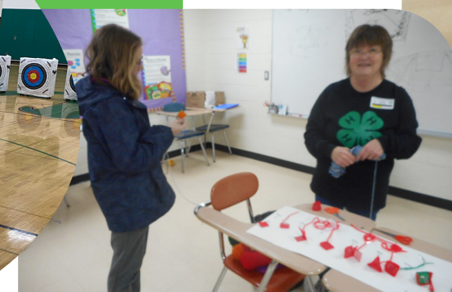
Plastic Canvas Kissies