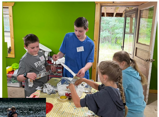
Campers made paper mache volcanos, painted them, and erupted this in small groups.