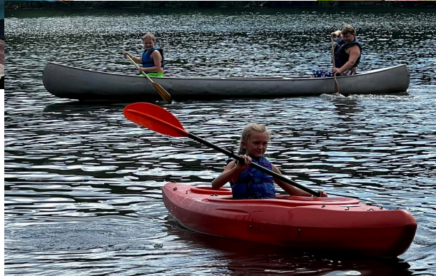
Campers had a chance to swim, kayak, canoe, and paddle board two different times at camp