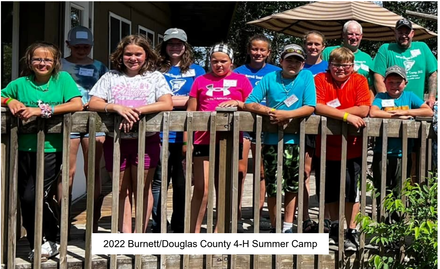
2022 Burnett/Douglas County 4-H Summer Camp