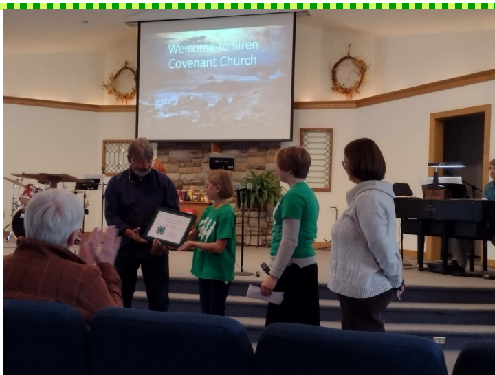
LEFT: Orange 4-H presenting Siren Covenant Church the 2021 Friend of 4-H Award.