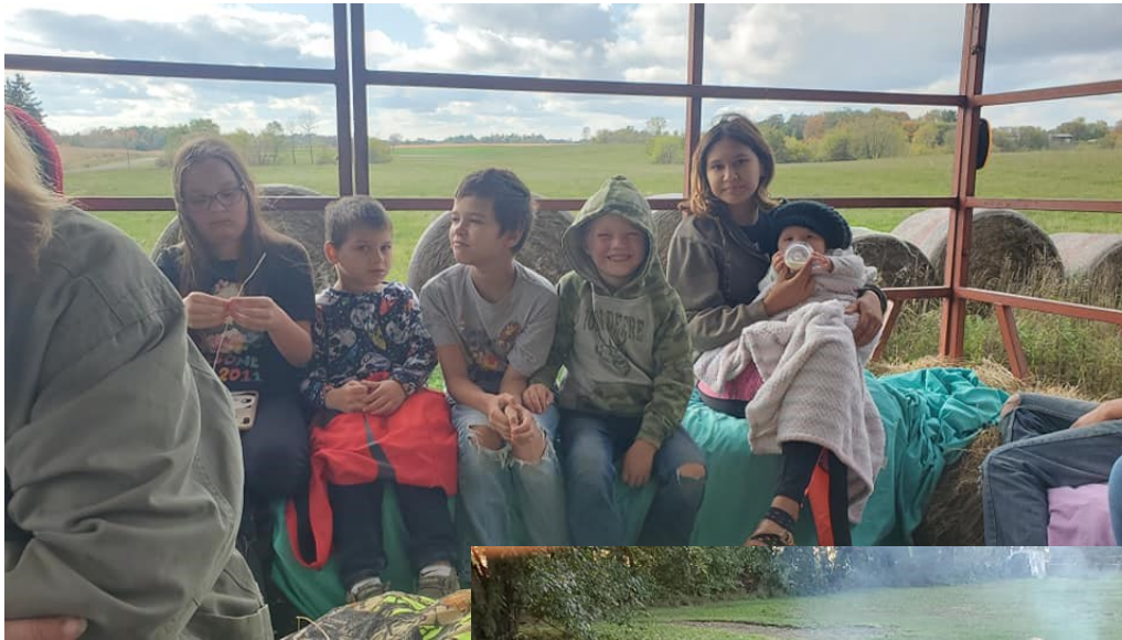
Jolly H's held their annual hayride and cookout