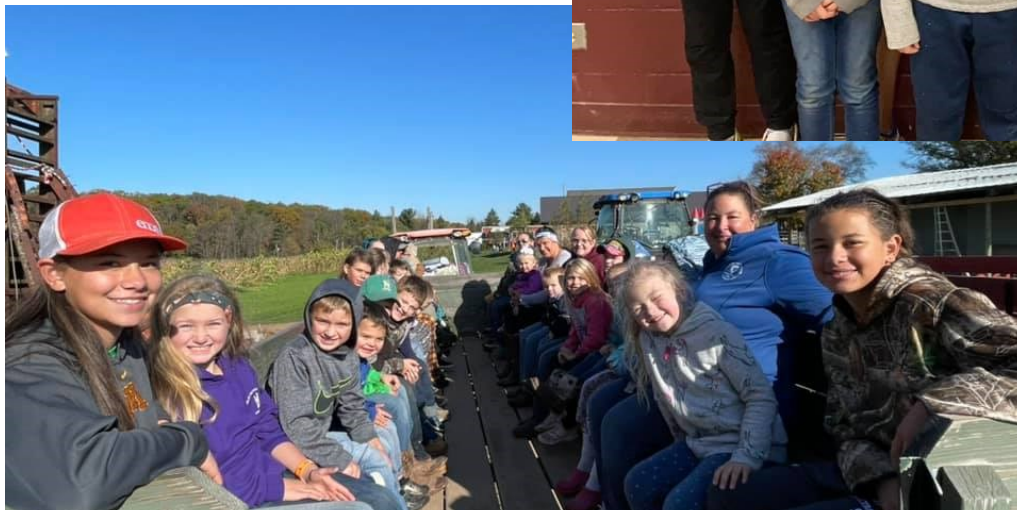
Orange 4-H toured Mommsen's Pumpkin Patch and enjoyed a hayride