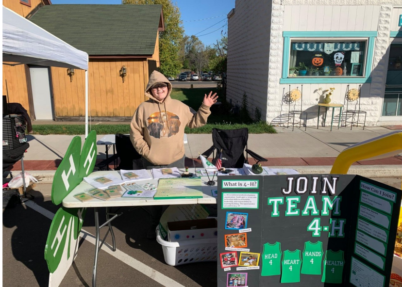
4-H promotion booth at Grantober Fest