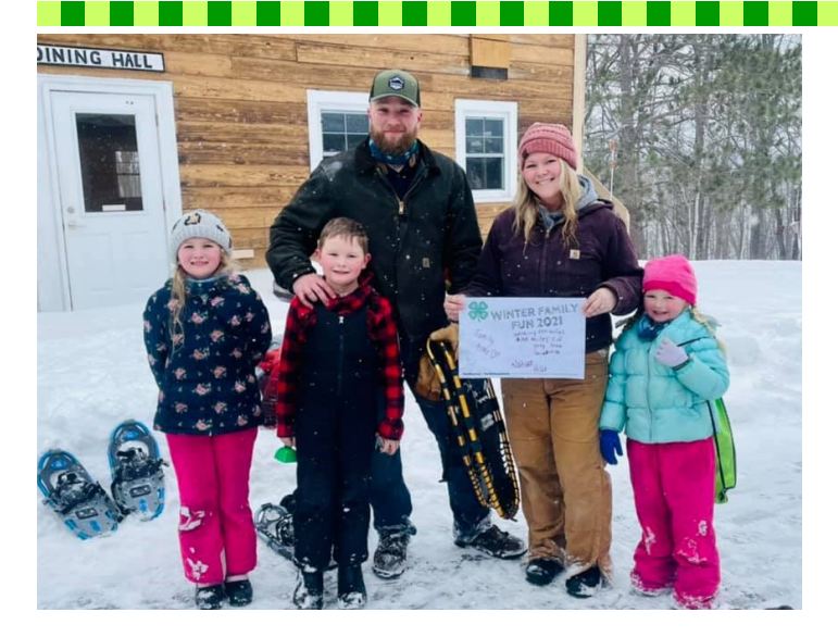
Pope Family at Winter Family Fun Day