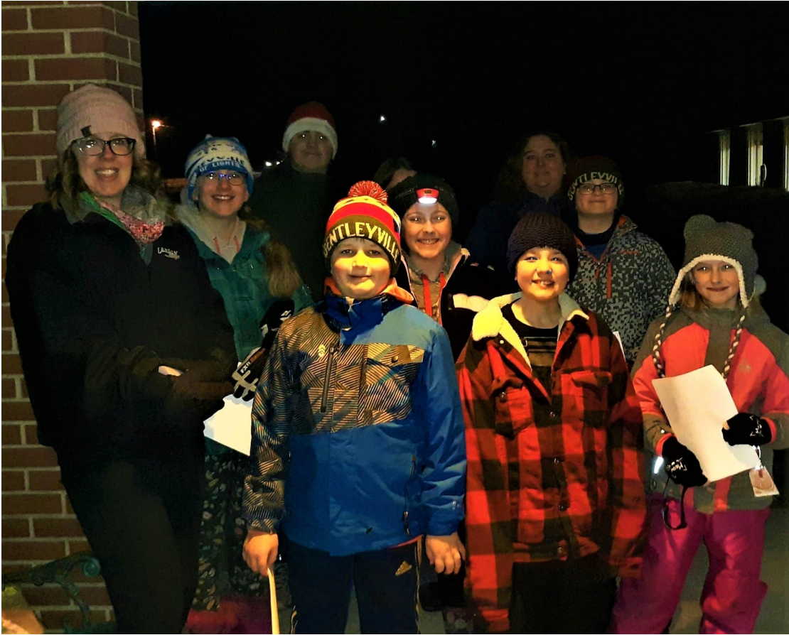
Orange 4-H members gathered to carol at local nursing home/assisted living facilities. (Face coverings off for pictures only)