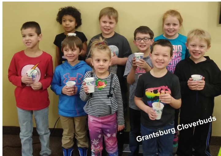
In January, Cloverbuds made Bird Seed Cakes in a paper cup mold.