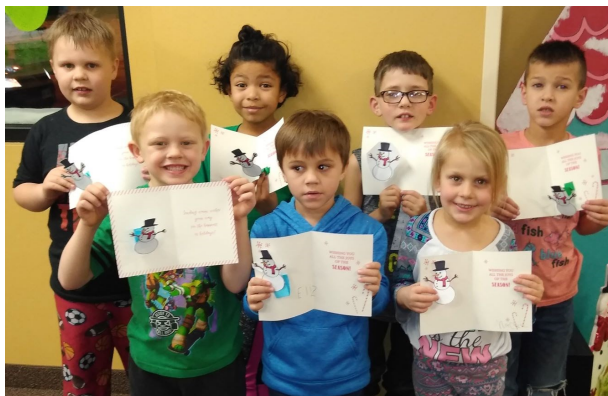
Grantsburg Cloverbuds made holiday pop-up greeting cards.

http://fyi.uwex.edu/wi4hprojects/arts-communication/ .