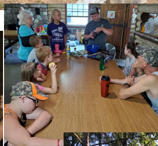
(center) Constellation Dot Paintings