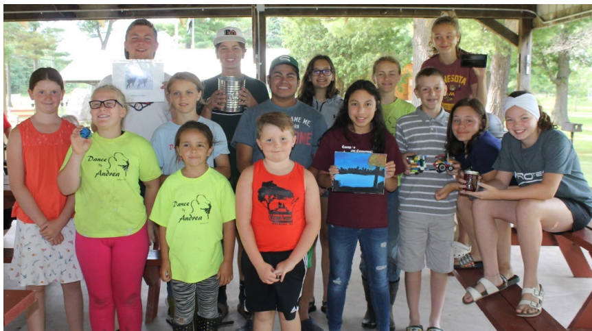
(left) Wood Creek 4-H Club share projects they plan to take to the fair during the July 21st Club Tour.