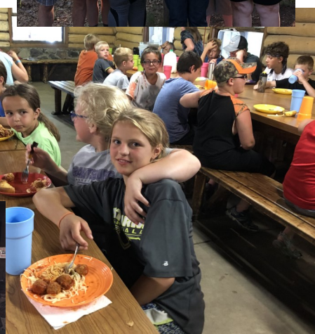
(Above) Meals... thanks to all 4-H clubs, everyone ate well.