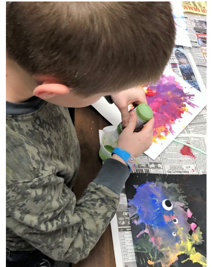
Cloverbuds made straw-blown art in their January project meetings.