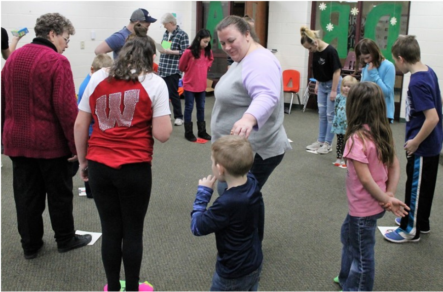
Wood Creek's Christmas Party