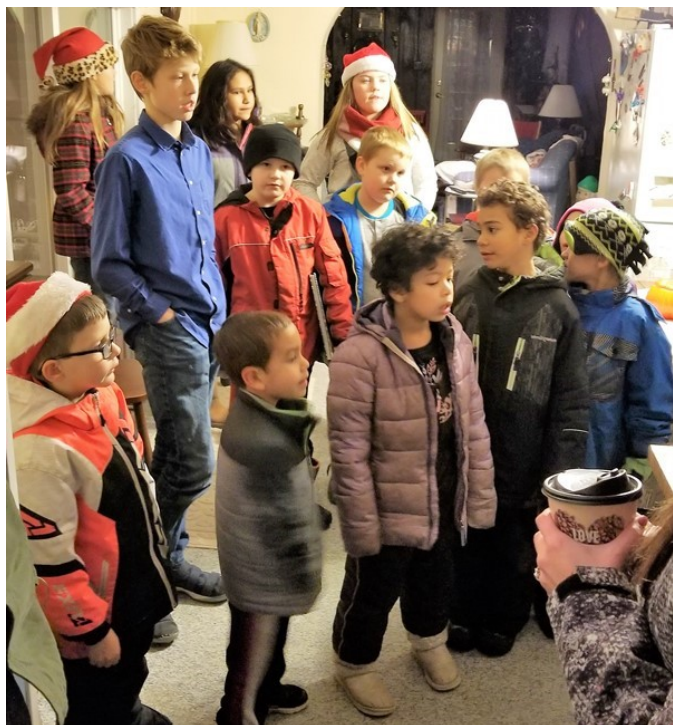
Jolly H caroled and practiced their Music Contest piece.