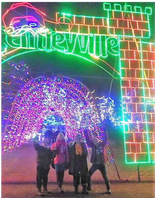
Branstad Bucks took a trip to Bentleyville.