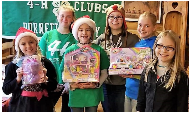
Orange rang the Salvation Army bell and donated gifts for Christmas for Kids.