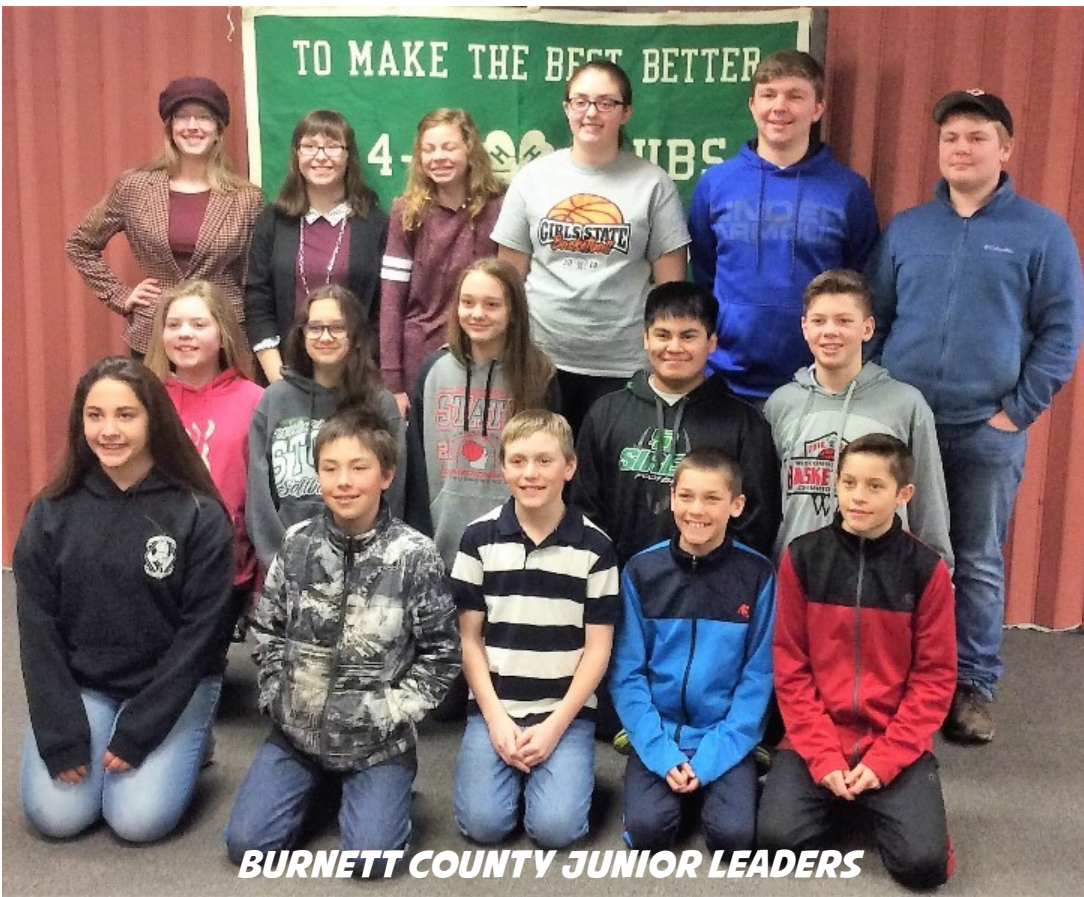
BURNETT COUNTY JUNIOR LEADERS