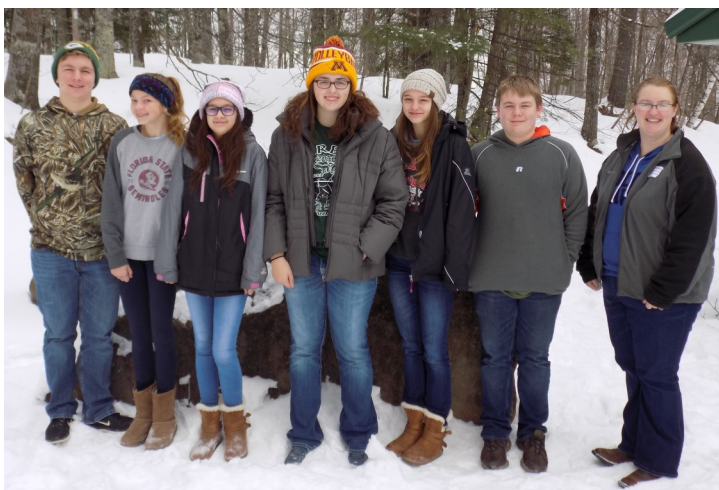
2018 Winter Campers and Educator.

ORANGE 4-H CLUB update: Members participated in the Music Contest in January and went tubing at Trollhaugen in February.