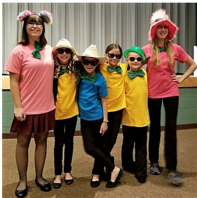
Orange members at the Music Contest and tubing.