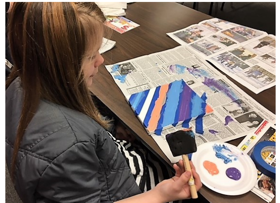
Cloverbuds and Tape Resist Painting