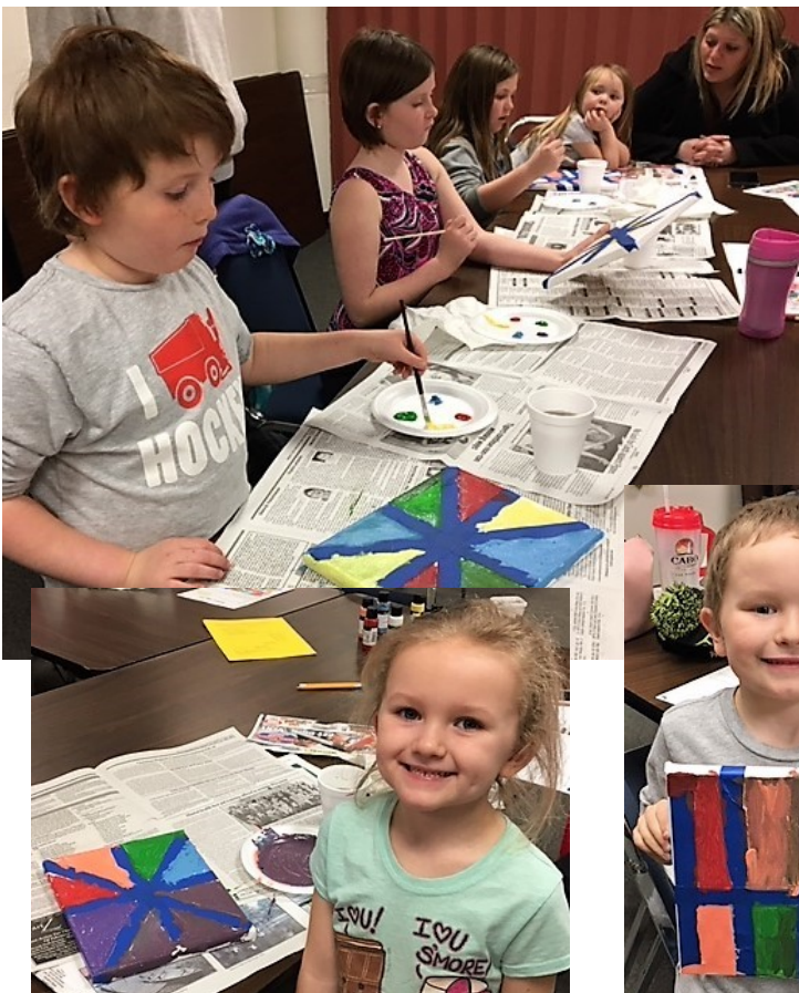
Cloverbuds and Tape Resist Painting