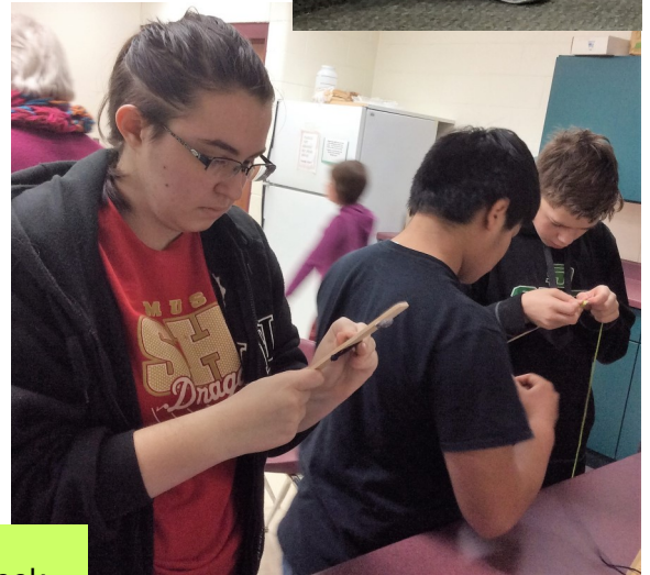
Wood Creek Club Meeting