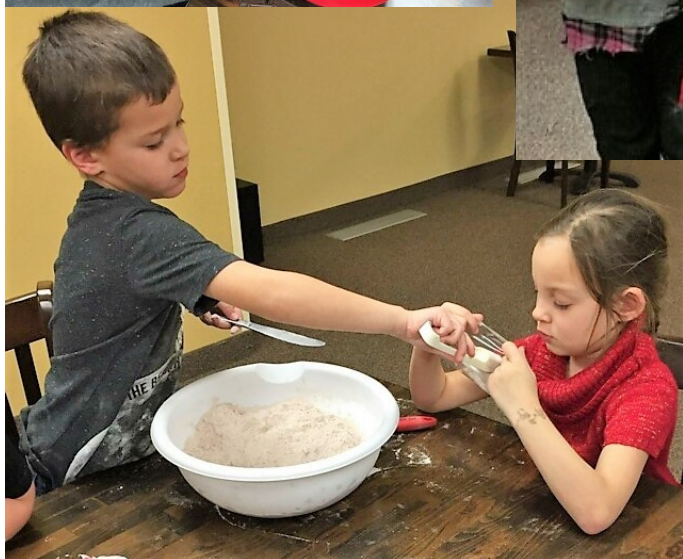
Siren and Grantsburg Cloverbuds learned about measuring and generosity at their December meetings. They made molten lava cake and put together mixes for gift giving.