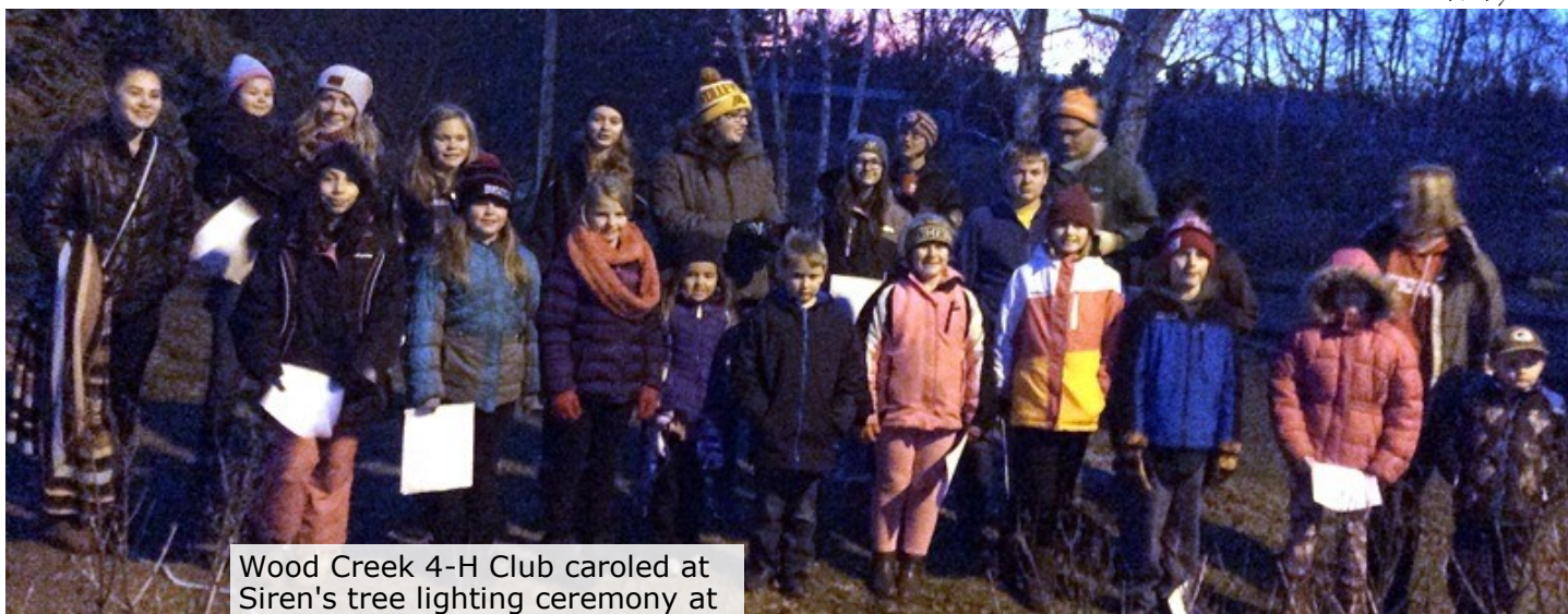
Wood Creek 4-H Club caroled at Siren's tree lighting ceremony at Veteran's Park, and at Lilac Grove apartments and Capes Assisted Living facility.