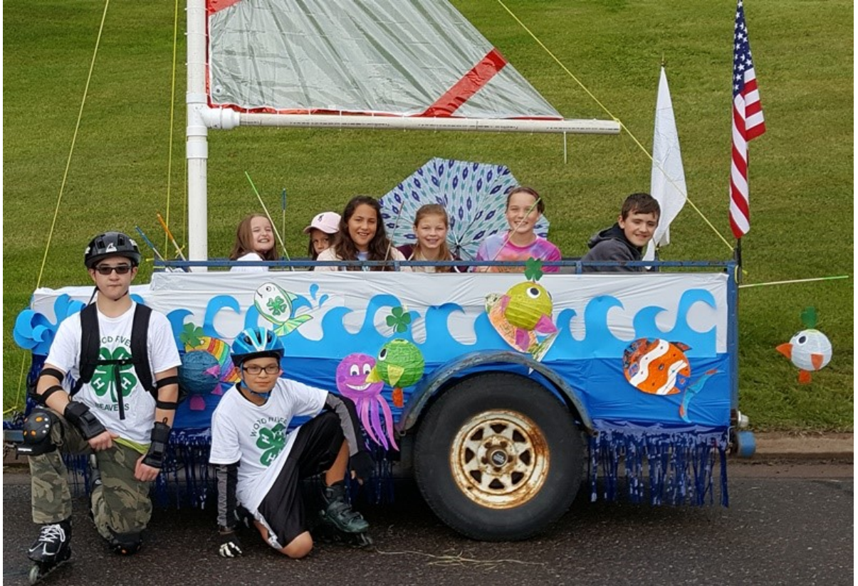
WOOD RIVER BEAVERS 4-H CLUB built a boat and went fishing for the Grantsburg Fair parade. They handed out fish candy with a label reading "4-H is a good catch!"

WOOD CREEK 4-H CLUB is working hard on their superhero themed window display.