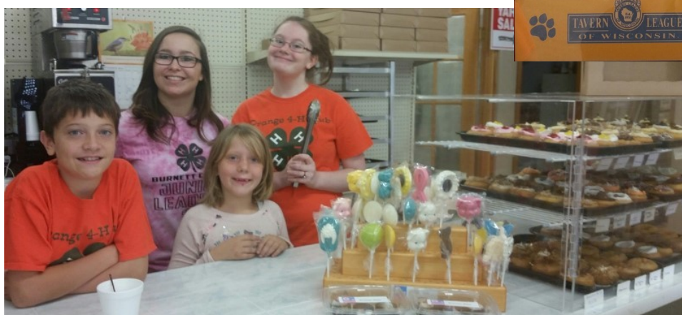
Orange volunteers at the sweet shop.