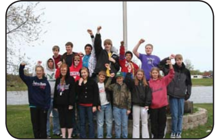
All the Amazing Racers