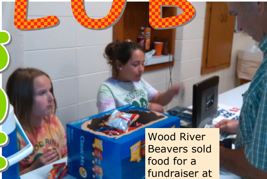
Wood River Beavers sold food for a fundraiser at Grantsburg's Music in the Park.