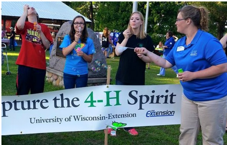
Capturing the spirit of 4-H at Siren's National Night Out.