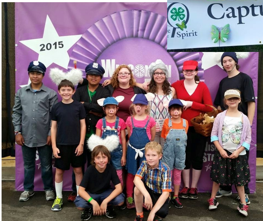
Orange Club (left) and Wood Creek Club (below) took their Club Drama and Club Music acts to the Wisconsin State Fair.