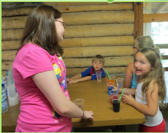
They made "villain drinks" (above) and superhero capes (right).