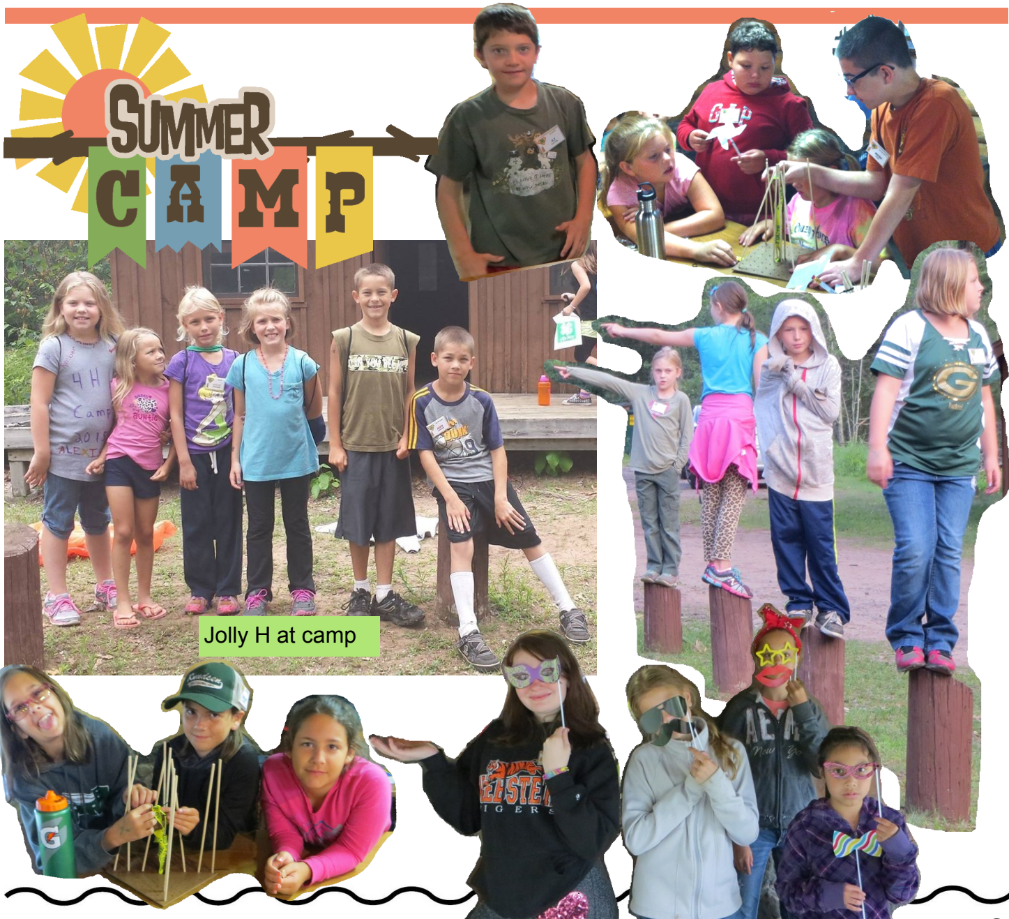
Jolly H at camp

Find more information at http://www.4-h.org/4-h-national-youth-science-day/ and ordering details at: http://www.4-hmall.org/ and enter "science day" in the search box.