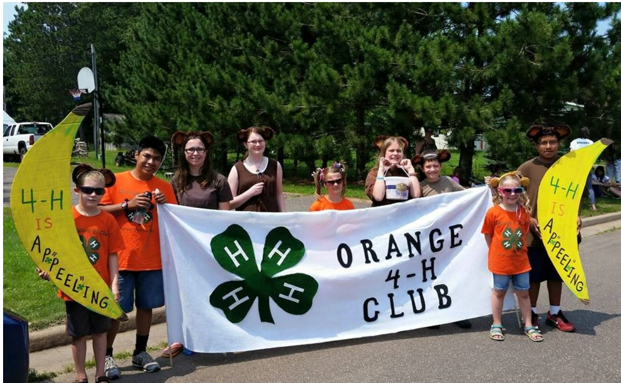
Is it Orange 4-H or a troop of monkeys preparing to march in Webster's 4th of July parade?