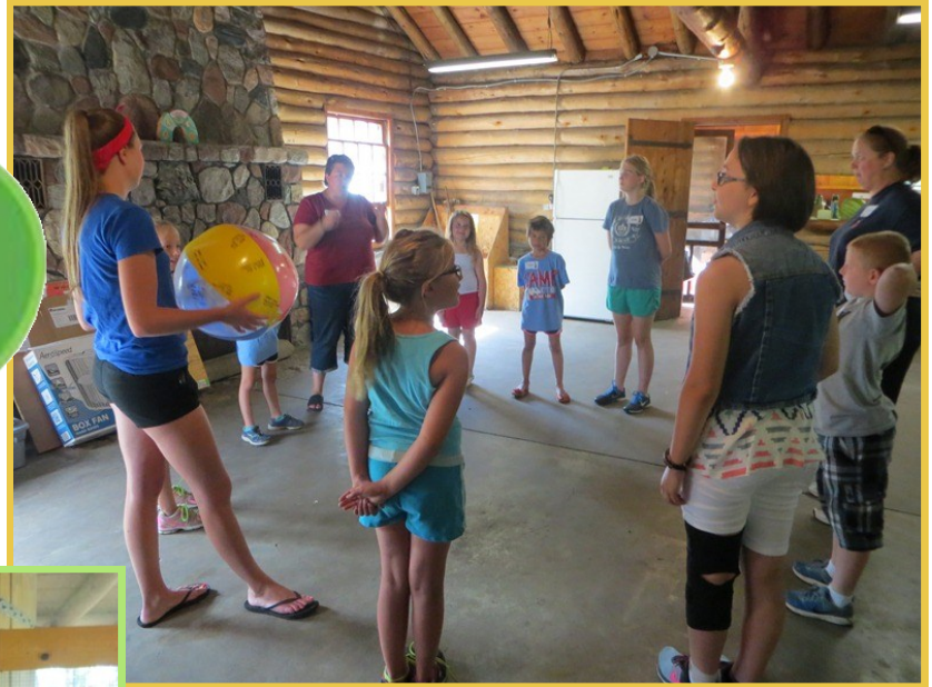
Cloverbuds played getting to know you games.

The next Cloverbud Meeting will be held on Monday, August 10th from 6:00pm - 6:45pm in the Burnett County Government Center, Room 165.