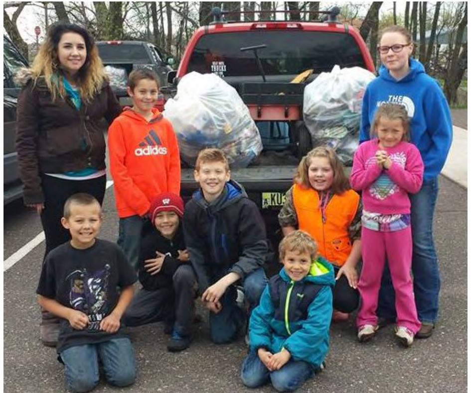
Jolly H completed their Adopt-a-Highway responsibilities!