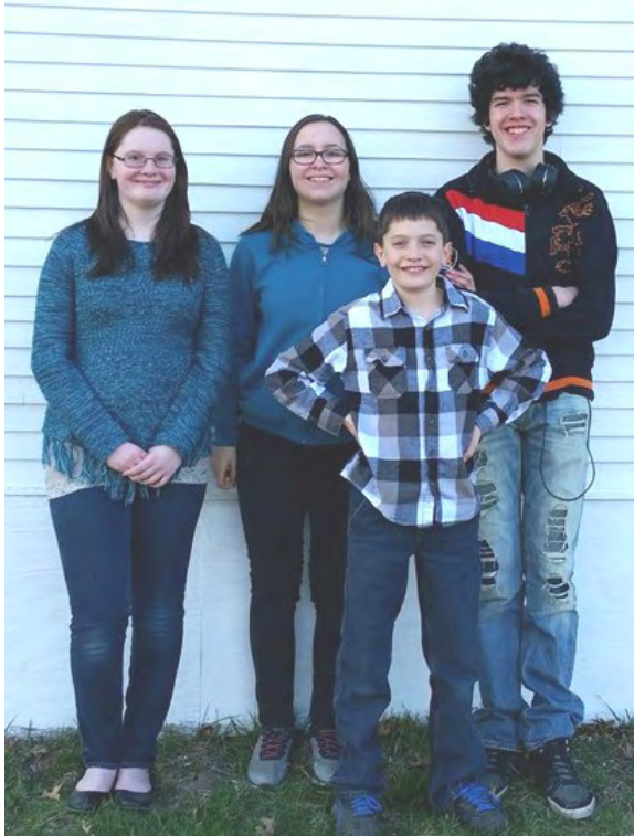
Orange club members spent several hours cleaning the yard of an elderly neighbor.