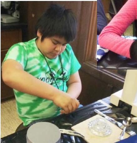
Making sculptures with spoons and forks.