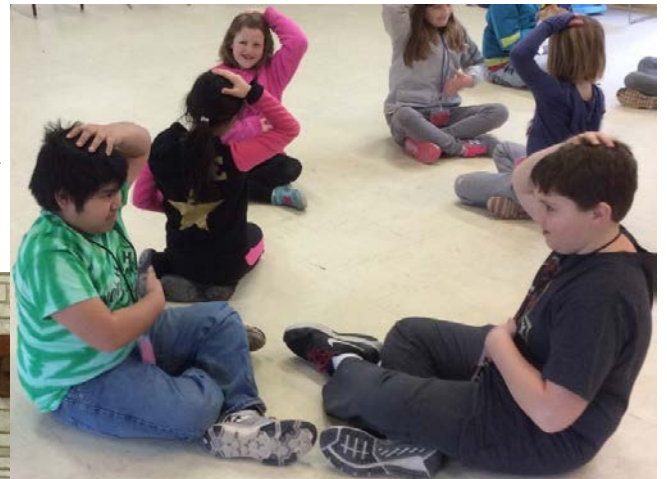
Drama projects. Right - mirror activity, Below - Three Little Pigs.